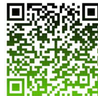
Key Milestones In Maldives

As we continue our path towards greater sustainability, we recognize that our actions today shape the future of our planet. We are proud of our collective efforts and invite you to join us by watching the following video. Simply scan the QR code or click the video link to view the Video