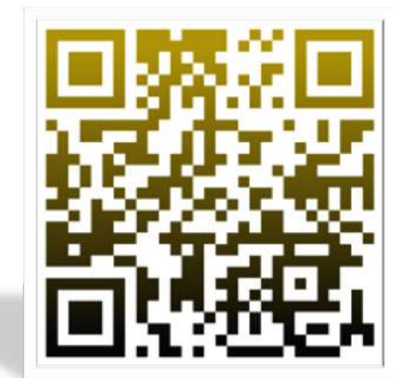
V03 / March / 2024