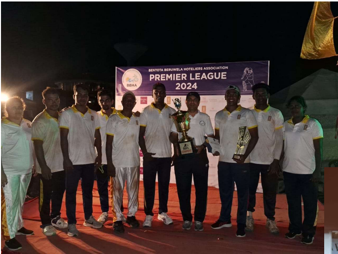
Join winners of cricket tournament organized by BBHA,