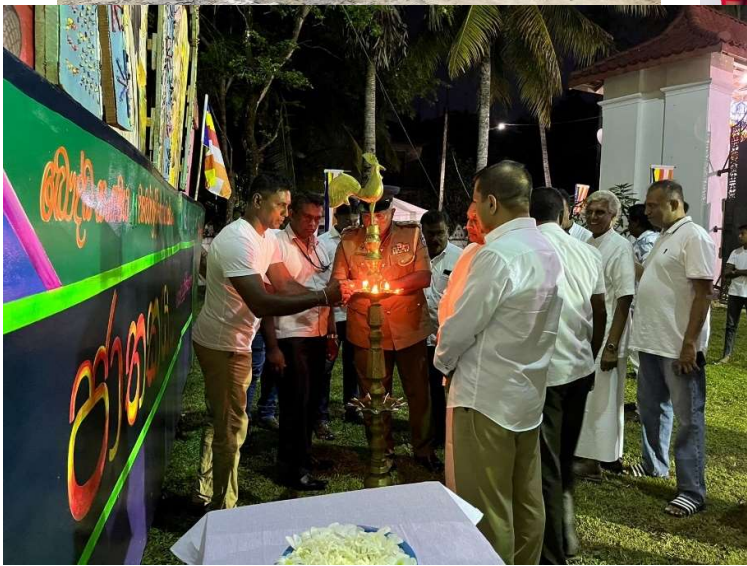
Donate and participate on Poson Poya day activity organized by Temple