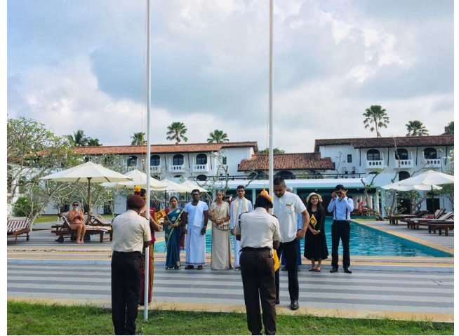
Independent day celebration at Maha Gedara