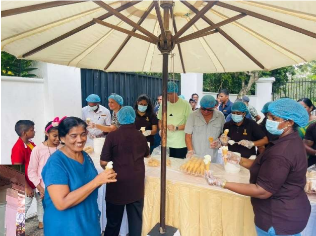
Ice cream Dansala on Poson Poya day